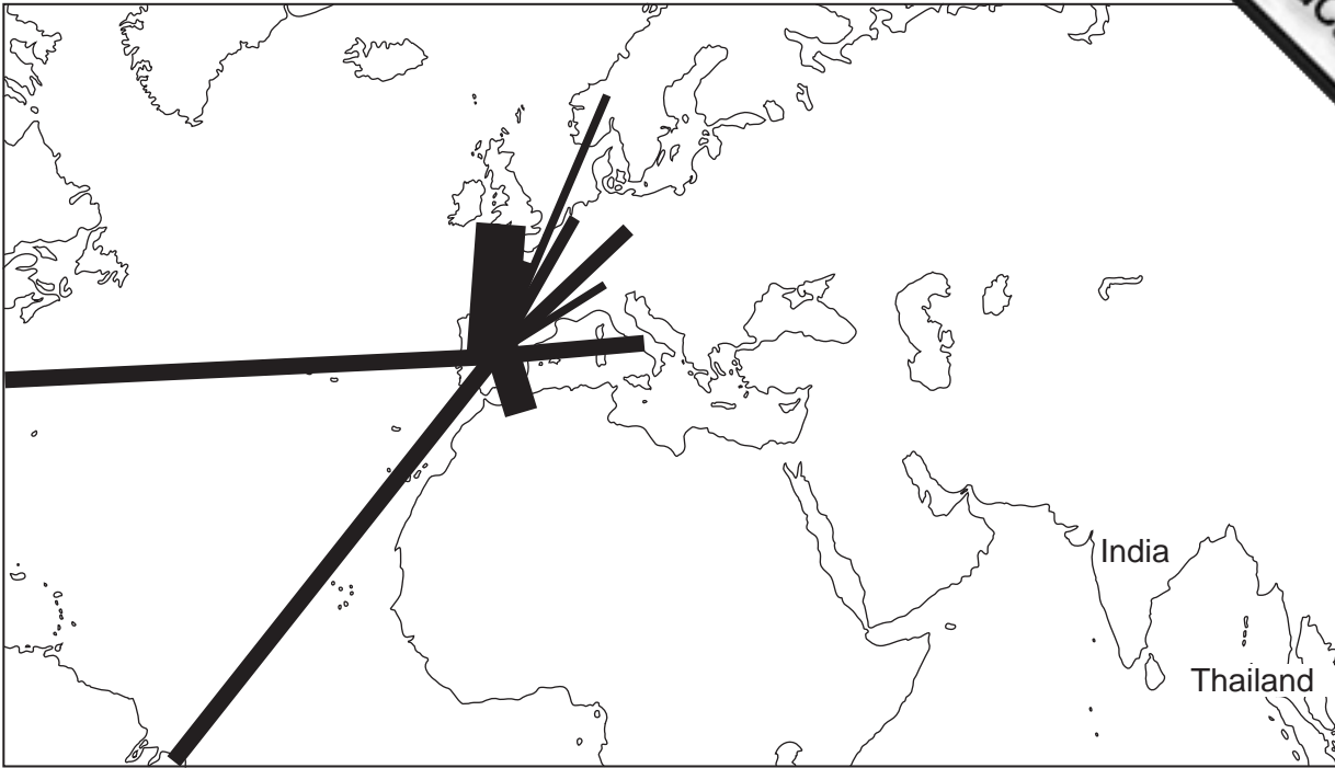
Scale: 1 mm = 1 person